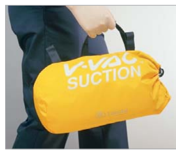
The V-VAC unit fits easily into many emergency kits. A separate carry bag is also available.